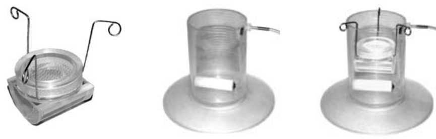
Brain Slice Keeper (S-BSK) + Brain Slice Keeper Holder (S-BSKH) = Complete System (S-BSK Combo)